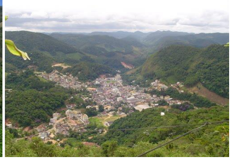
City of "Santa Maria de Jetibá"/ES

The tourist city of "Santa Teresa"/ES is just 78 km from the VIX airport ("Vitória"/ES), about 1:20 h by bus, on the BR-101 and ES-261 highways, and with headquarters 675 meters above sea level, and with a maximum altitude of 1083 m. "Santa Leopoldina"/ES with headquarters at 17 m above sea level, as it is located in a valley formed by the hydrographic channel of the river "Santa Maria" and a maximum altitude of 915 m. "Santa Maria de Jetibá"/ES is headquartered at 720 m above sea level and at a maximum altitude of 1450 m in "Pedra do Garrafão" mountain", and the city also has as Horto Florestal (preservation reserve) and several waterfalls in your municipality.