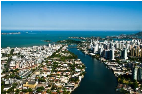
City of Vitória/ES (aeroporto VIX) - capital of ES State

The tourist city of "Santa Teresa"/ES is just 78 km from the VIX airport ("Vitória"/ES), about 1:20 h by bus, on the BR-101 and ES-261 highways, and with headquarters 675 meters above sea level, and with a maximum altitude of 1083 m. "Santa Leopoldina"/ES with headquarters at 17 m above sea level, as it is located in a valley formed by the hydrographic channel of the river "Santa Maria" and a maximum altitude of 915 m. "Santa Maria de Jetibá"/ES is headquartered at 720 m above sea level and at a maximum altitude of 1450 m in "Pedra do Garrafão" mountain", and the city also has as Horto Florestal (preservation reserve) and several waterfalls in your municipality.