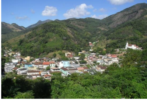
City of "Santa Leopoldina"/ES