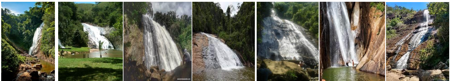
"Véu de Noiva" "Rio do Meio" "do Palito" "de Holanda" "do Galo" "Moxafongo" "Country Club"

The stage will have the modalities of "Mountain Bike", "Trail Run" and "Canoeing" and two special vertical tests with "Rapelling" in waterfalls, and navigation by topographic map in colored canvas in high resolution of printing, in a route about 200 km to 210 km, with an expected duration of 24h to 30h, passing through mountainous regions and the famous "waterfalls" circuit, with a forecast of going through 6 to 7 different waterfalls.