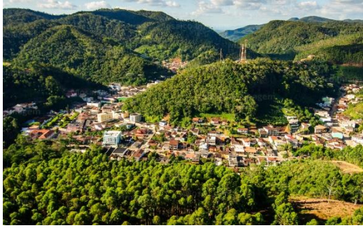
City of "Santa Teresa"/ES

The FCCA intends to carry out the Stage A1 Brazil Series in the region of the "Capixabas" mountains of the State of "Espírito Santo" (ES), based in the municipality of "Santa Teresa"/ES and the route also passing through the neighboring municipalities of "Santa Leopoldina"/ES and "Santa Maria de Jetibá"/ES , a region known as "of the Immigrants". "Santa Teresa"/ES was the first city of Italian colonization in Brazil. "Santa Leopoldina"/ES initially had Swiss, German, and Austrian immigrants. "Santa Maria de Jetibá"/ES had German and Pomeranian colonization.